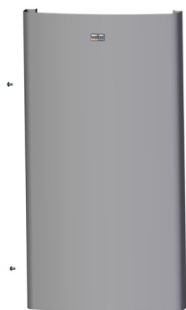
Front panel, grey